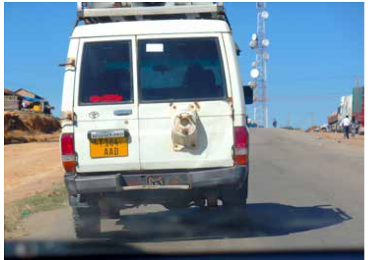
Marie Stopes International hired this vehicle for advertising the use of contraceptives for fertility control. This house-to-house approach is currently being used in Njombe.