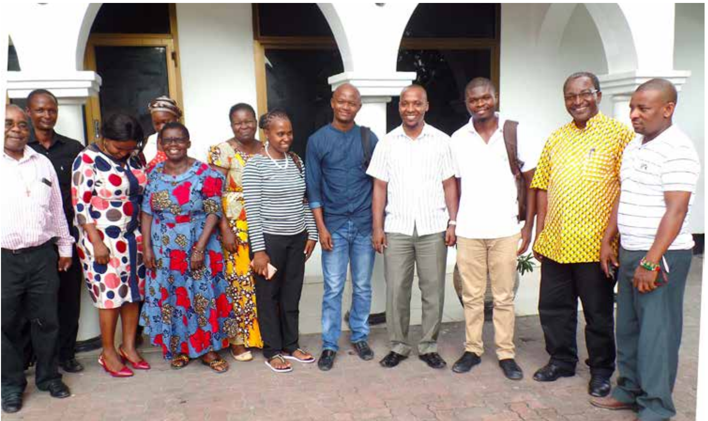
Journalists who attended a press conference at the National Hotel on December 11, 2017 in Dar es Salaam.

MSI runs oppressive fertility control programs, which indirectly coerces women into using contraception immediately after delivery. Some women are sterilized without their knowledge after having caesarean