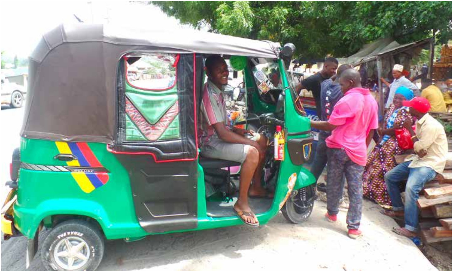
Rickshaw tricycle, used by Marie Stopes International for village population control programs.

On reading the Health Ministry’s “Sexual and Reproductive Health and Rights,” I recognized the document as one authored by MSI in 2004 but rejected by previous Ministry of Health Ministers for obscene content. Youth “rights” written into the document are those adopted and promoted by International Planned